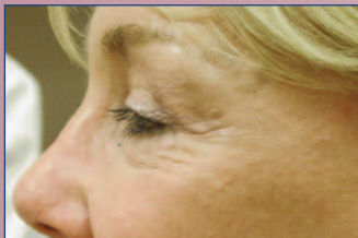
Patient before Tx