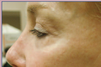
Patient after three DOT fractional CO 2 laser treatments for the Madonna Lift